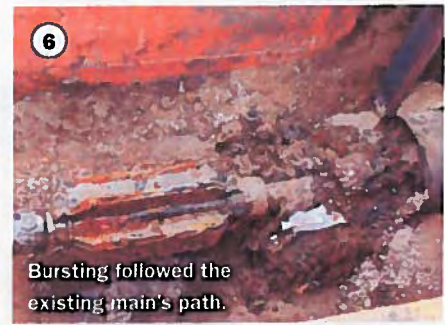
Bursting followed the existing main's path.