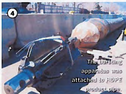
The bursting apparatus was attached to HDPE product pipe.

This project has paved the way for CSU to plan replacement of hundreds of miles of deteriorating steel pipe using static pipe-bursting that travels an existing main's path. The utility will realize significant savings in restoration costs and minimal social disruption. With the static pipe-bursting method, crews can complete installation without disrupting other utilities that share the right-of-way.