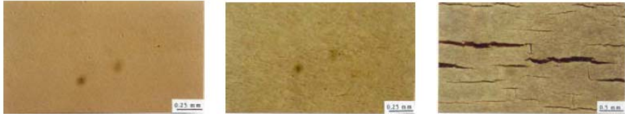
1.A: 10% of Pipe Lifetime