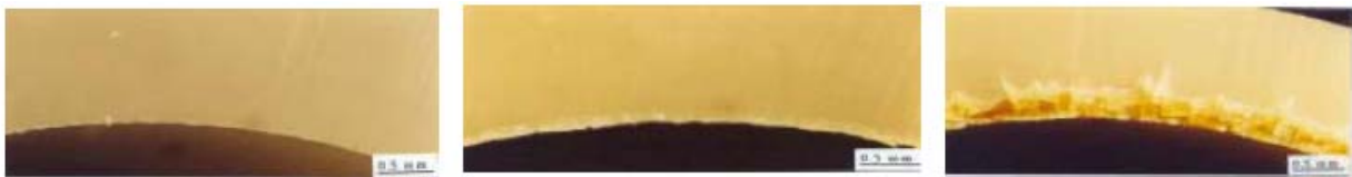
2.A: 10% of Pipe Lifetime